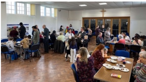
Lent Messy Church