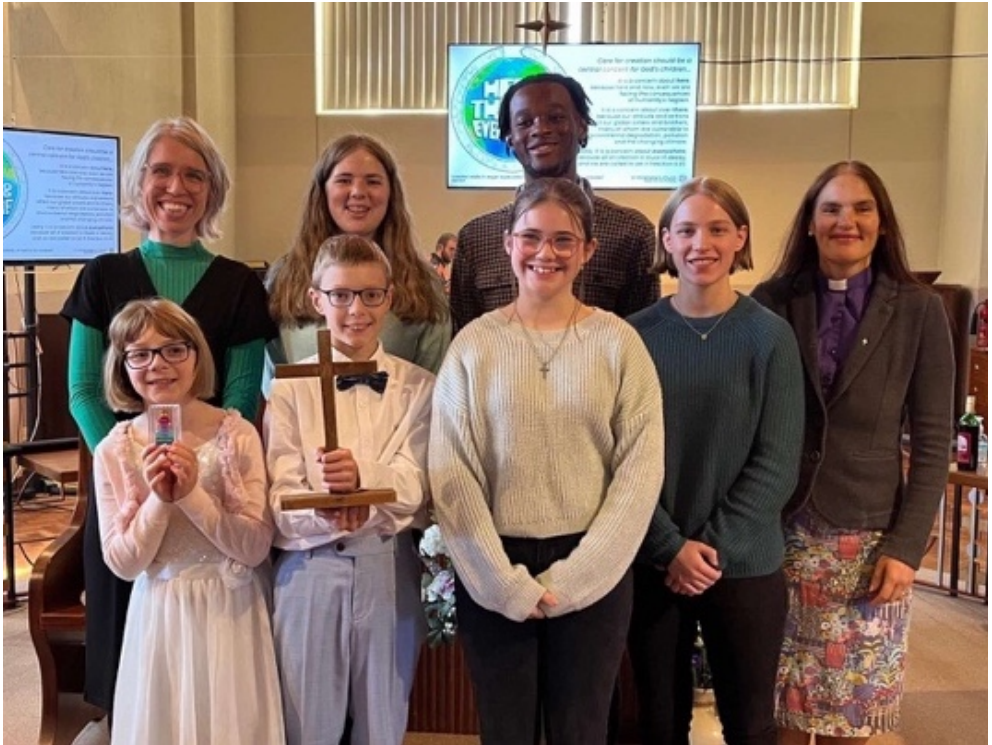
Celebrating the Confirmation of six of our church community in September with Sophie, Bishop of Coventry